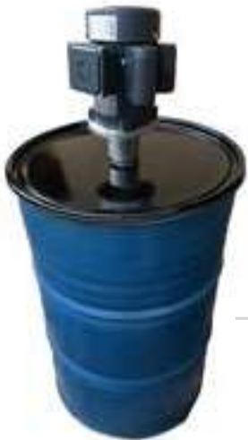
DRUM LID MOUNT

This removable Open Head Drum Mixer allows for high viscosity and high pumping and mixing control you expect from Dynamix.