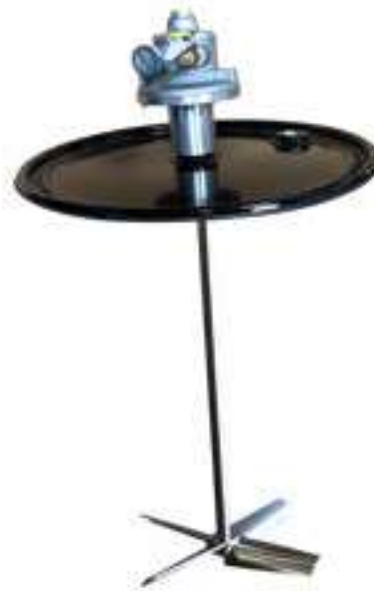
DRUM LID MOUNT MIXER