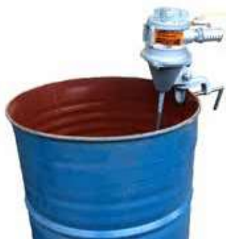
LIGHT DUTY CLAMP MOUNT

Available with single or dual 4" to 5" marine propellers.