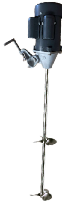
LIGHT DUTY CLAMP MOUNT MIXER

*All models are available with air or electric drives. These mixers are typical representations.